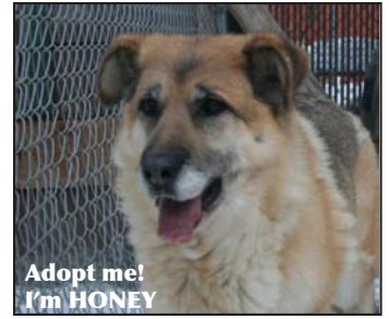
Adopt me! I'm HONEY

Animals shown here have been spayed/neutered, vaccinated, micro-chipped and are in good health. Call 344-3622 or visit www.alaskasPCA.org for details.