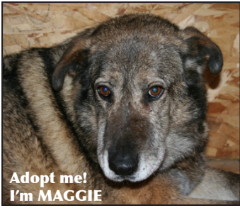
Adopt me! I'm MAGGIE