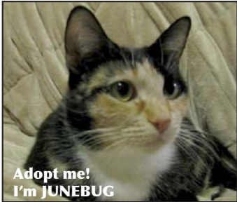
Adopt me! I'm JUNEBUG