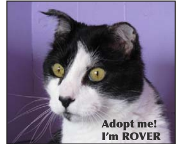
Adopt me! I'm ROVER